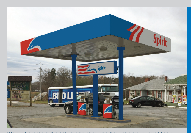
We will create a digital image showing how the site would look branded as a Spirit® station.

Details are available from your supplier or thespiritbrand.com/spirit-test-drive