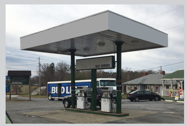
Send us a digital photograph of an existing site.

Test-Drive was developed by the Spirit® Brand design team to help station owners visualize how a site will look as a Spirit® branded location.